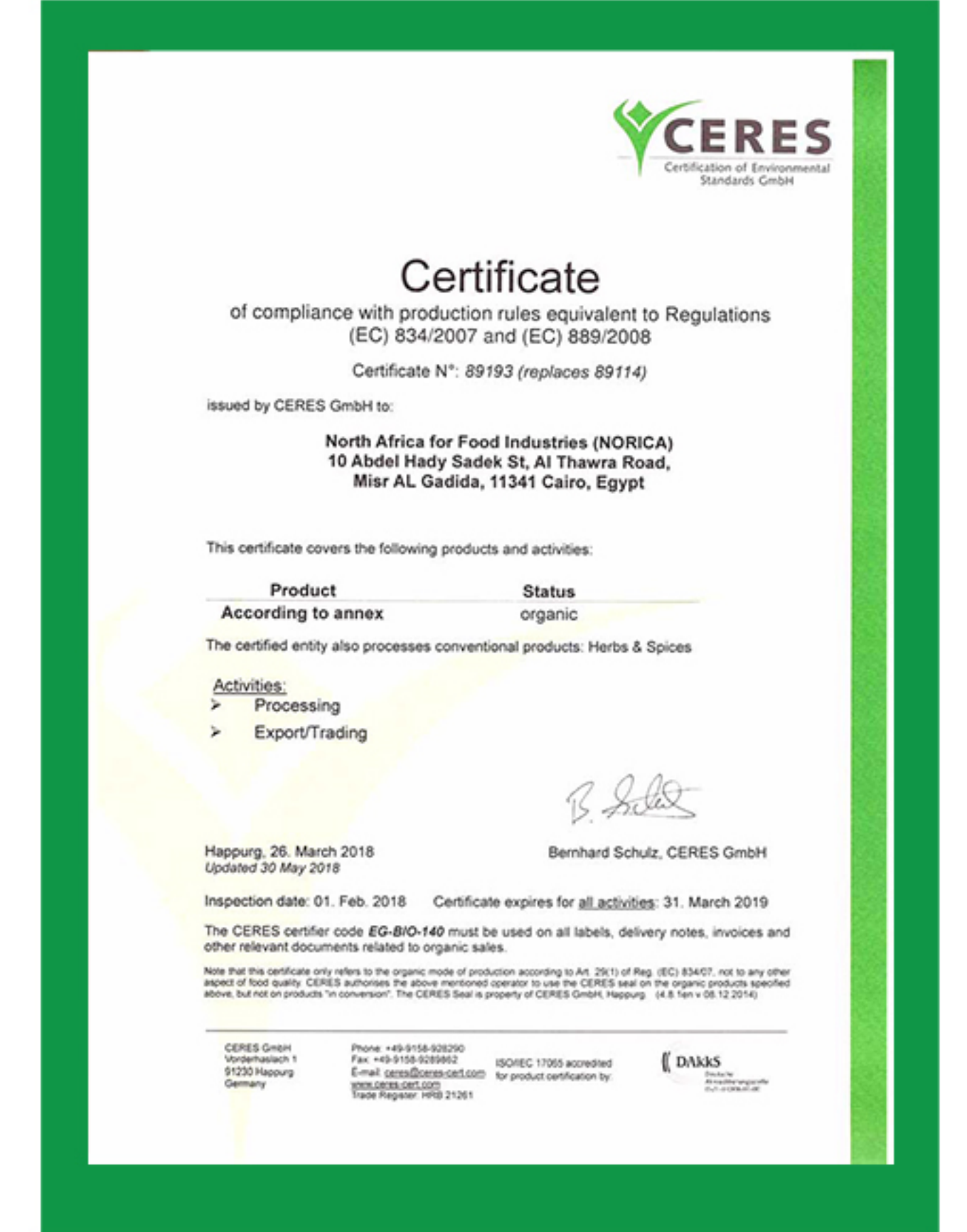
Norica-Organic-certificates - 1